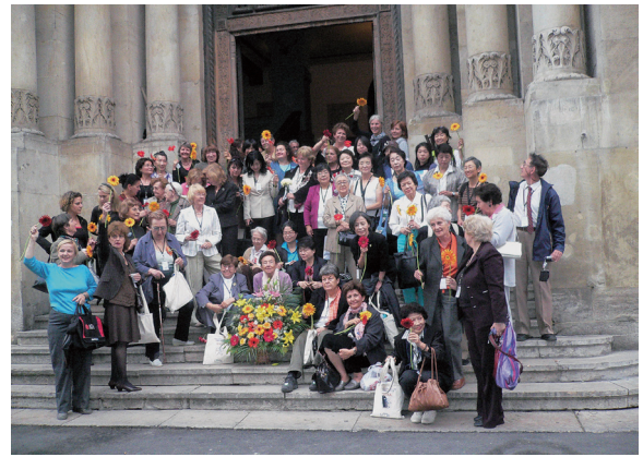
After the 15th Congress UIFA Bucharest, Romania, 2007

Through various activities, UIFA JAPON aims to 1) contribute to the activities of the UIFA, 2) to