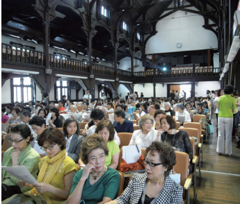
At the UIFA JAPON Commemorative Lecture, 2009

The UIFA is for women all over the world who are working for research and creation in architecture, and urban and environmental planning. Its aim is to share information, to develop their professional work, to favor friendship links between all members, and to improve the standard of activities.