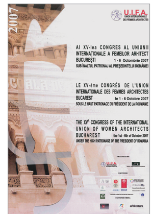
UIFA JAPON'S Report, the 15th Congress of the UIFA Bucharest, Romania, 2007